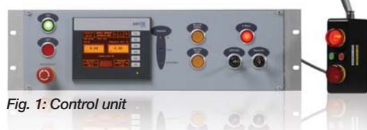
Fig. 1: Control unit