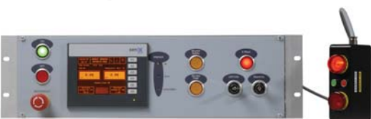
Fig. 1: Control unit