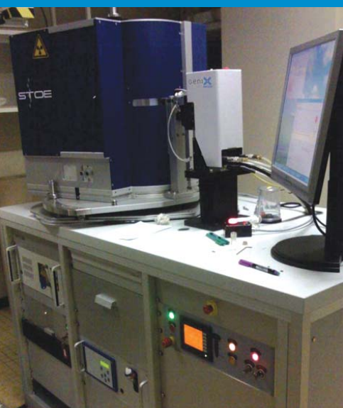
Fig. 1 : The combined GeniX - IPDS2T set-up installed at EPFL in Lausanne.