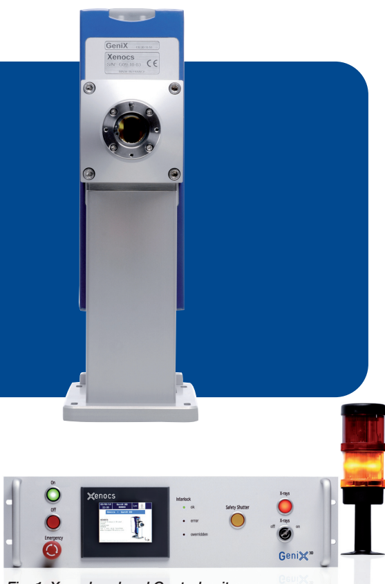
Fig. 1: X-ray head and Control unit

The GeniX 3D Cu High Convergence combines a high brightness, low power X-ray source with aspheric FOX3D multilayer optics to deliver an intense monochromatic Cu K \alpha beam focused on a small spot with high convergence angles of few degrees. It is provided with a control and command unit having intuitive user interface and implementing advanced functionalities to maintain a safe operation of the system.