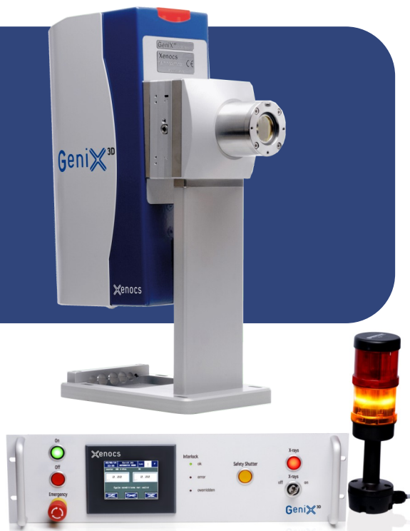
Fig. 1: Beam delivery system head and control unit

The GeniX 3D platform is in the continuation of the GeniX for high reliability, low maintenance and high stability. The GeniX 3D platform implements intuitive alignment concepts making it as easy to use and maintain as a standard sealed tube.