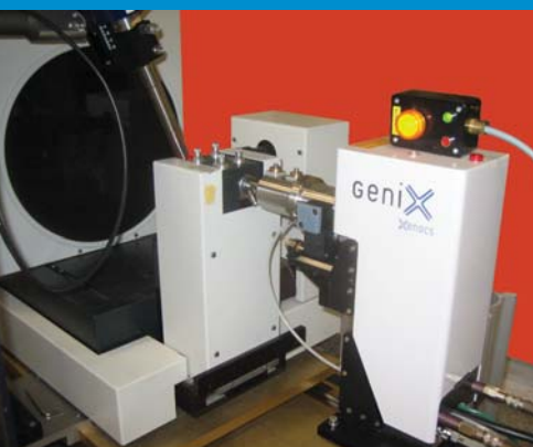
Fig. 1 : The GeniX Cu High Flux beam delivery system installed at the EMBL Grenoble outstation.