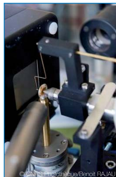
Fig. 2 : Experimental set-up : X-ray beam is coming from the right on the picture. The CCD camera is on the left. Collimator of the SDD detector is seen on the first plan.

The orientation of crystallites with respect to the platelet surfaces is best revealed when the incident x-ray beam is coaxial with the stretching direction. For this purpose, the sample is maintained in a strained state as depicted below. The remaining pieces of rubber outside the metallic holder are non-stretched and only contribute to the anisotropic or amorphous part of the x-ray diagram; this gives an additional difficulty for the measurement as they also absorb part of the diffracted beam.