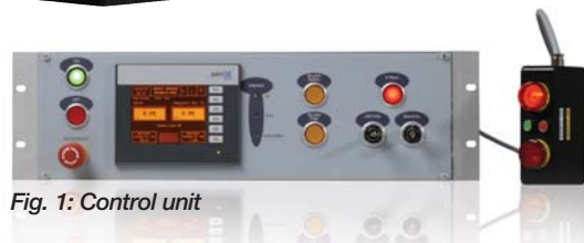
Fig. 1: Control unit

The GeniX Cu High Convergence X-ray beam delivery system combines a high brilliance micro focus X-ray source with the latest FOX3D optic technology to deliver an intense, monochromatic X-ray beam with excellent focusing characteristics.